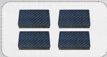
Rubber lifting blocks included.